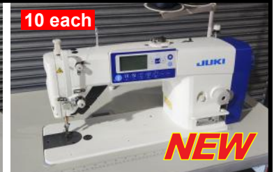
Juki Model DDL-8000A Single Needle Lockstitch Fully Automatic Functions $1,795.00 each