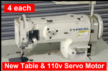
Typical Model TW1-1541 Single Needle Walking Foot Manual Back Tack / Foot Lift $995.00 each