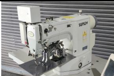
Supsew Model 460AS-HF Programmable Pattern Tack 60mm x 40mm Sew Area $2,995.00