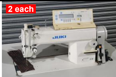
Juki Model DLD-5430N-7 Single Needle Differential Feed Full Automatic Functions $2,285.00 each