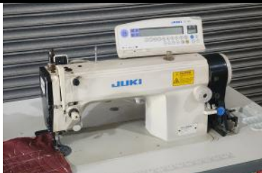
Juki Model DLU-5490N-7 Single Needle Top Feed Full Automatic Functions $2,285.00