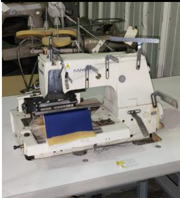
Kansai Special Chain Stitch Manual Footlift Includes Table, Stand, and 110v/220v Servo Motor 12 Needle Chain Stitch $1,950.00 each 25 Needle Chain Stitch $2,450.00 each 33 Needle Chain Stitch $2,950.00 each