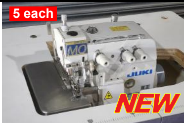
Juki Model MO-6804S 3 Thread Serger Manual Footlift. 110 volt $1,495.00 each