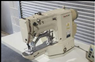
Typical Model GT-6430D Programmable Bar Tack Sewing Machine $2,495.00