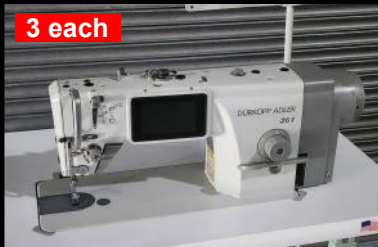
Durkopp Adler Model 261 Single Needle Lockstitch Full Automatic Functions $795.00 each