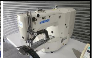
Juki Model LK-1900A-HS Programmable Bar Tack Currently Set up as Circle Tack $2,450.00