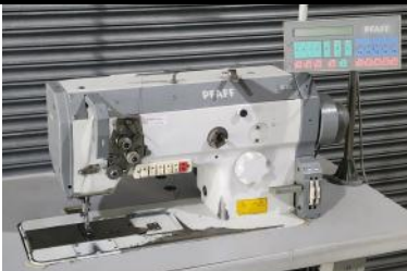
PFAFF Model 1420 Single Needle Walking Foot Automatic Functions $995.00