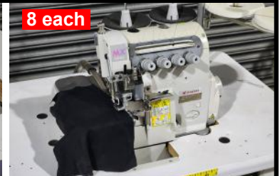
Pegasus Model MX-5214 4 Thread Serger with Thread Trimmers & Pneumatic Footlift $1,595.00 each