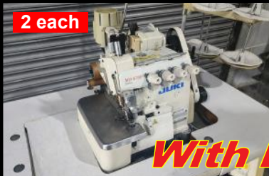
Juki Model MO-6714S 5 Thread Safety Stitch Serger with Racing Puller $1,495.00 each