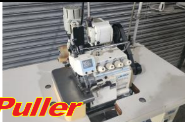
Juki Model MOJ-2516N 5 Thread Safety Stitch Serger with Racing Puller $1,250.00