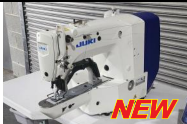
Juki Model LK-1900SS Programmable Bar Tack One at This Price! $2,995.00